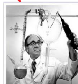
Stanley Miller (1912-2007)